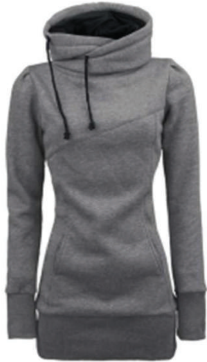
Ladies GYM Hoodies