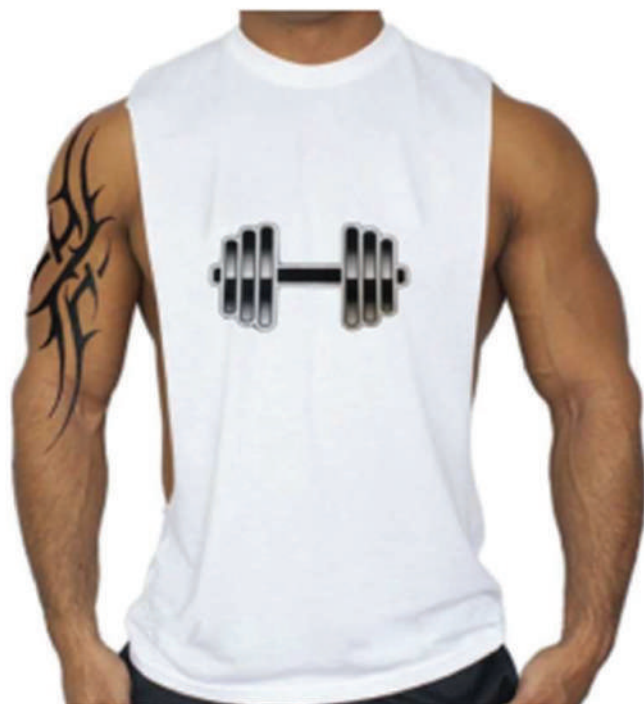
Deep Cut Singlet