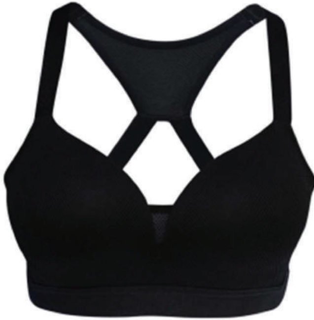
Ladies Fitness Bra